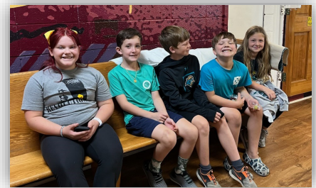
(left) Our Kingston kids and friends served at CAP on October 10. They were part of CAP's "Fresh Express Food Drive."